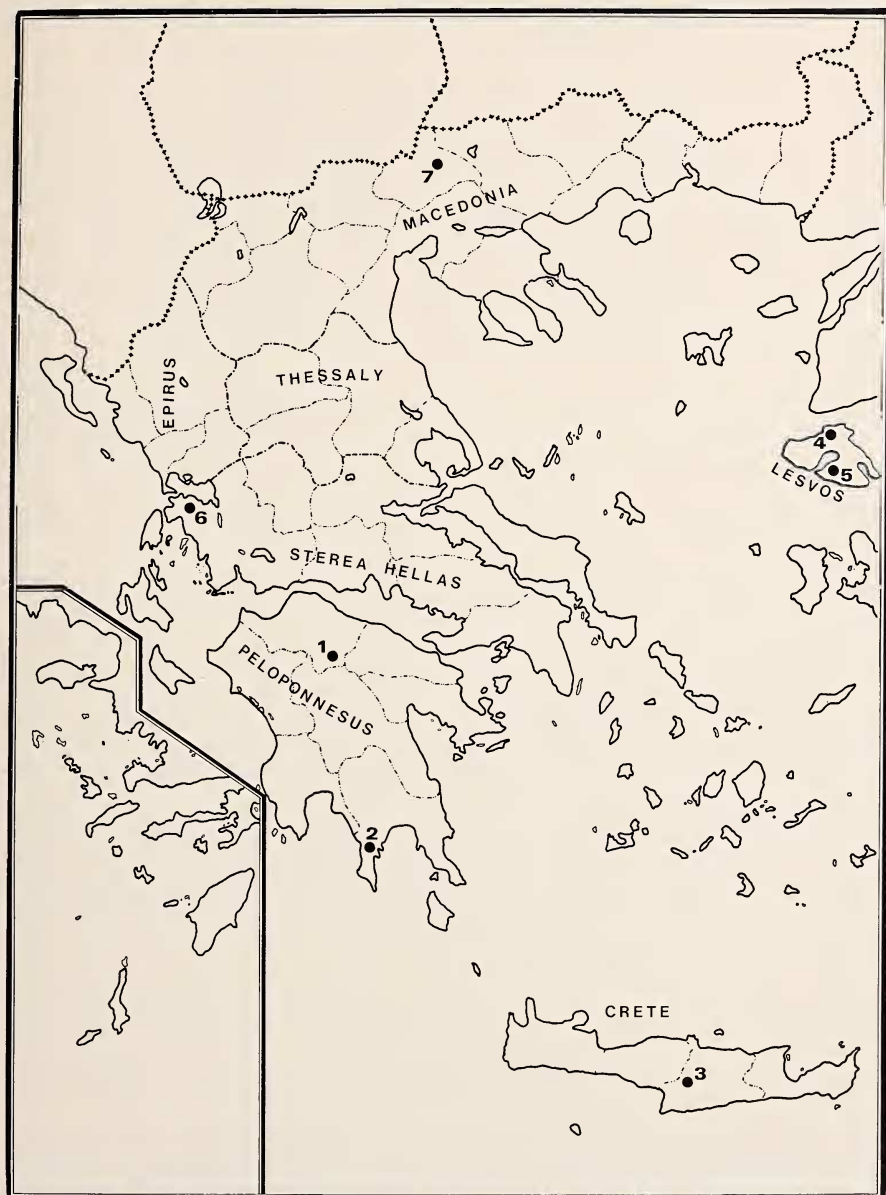
Fig. 1. Map of Greece showing the localities of the specimens of Myotis blythii studied in this paper. — 1, cave "Limnon", Achaia; 2, Flomochorion, Laconia; 3, cave "Micro Labyrinthaki", Eracleion; 4, Mithymna; 5, Polychnitos; 6, Monastiracion, Acarnania; 7, cave "Saranta Camares", Kilkis.